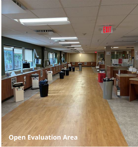
Open Evaluation Area