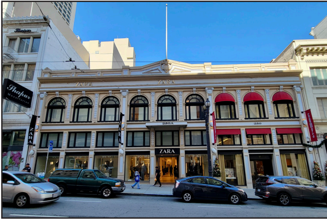
The space is a portion of the premises that housed the historic Gump's store for nearly a century.