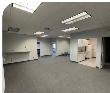
INTERIOR OF AVAILABLE SUITE