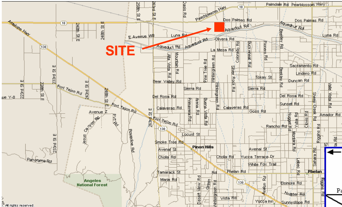
SE Corner of Wintergreen Road & Dos Palmas Road., South of Hwy 18 (Palmdale Road) San Bernardino County