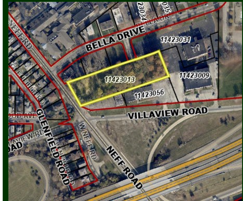
18805 Neff Rd., Cleveland, OH 44119

No warranty or representation, express or implied, is made as to the accuracy of the information contained herein. It is submitted subject to errors, omissions, price changes, rental or other conditions, withdrawal without notice, and to any special listing conditions imposed by our client.