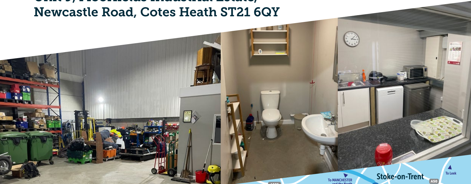
Typical unit. Photos for illustration purposes only