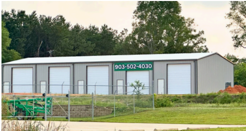
BUILDING STREET VIEW

SIZE 5250 SQFT EACH BUILDING 30,000 SQFT AVAILABLE