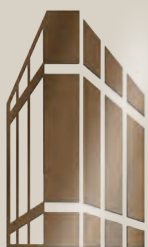
THE LANDOW BUILDING