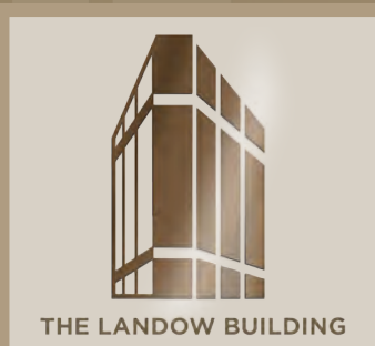
THE LANDOW BUILDING

The Landow Building's unique triangular silhouette is an instantly recognizable landmark. Its seven-sided floor plan provides for unusually competitive full and multi-tenanted floor core factors (8.6% and 15%, respectively) and floor plates that efficiently accommodate multi-tenancing and small office suites.