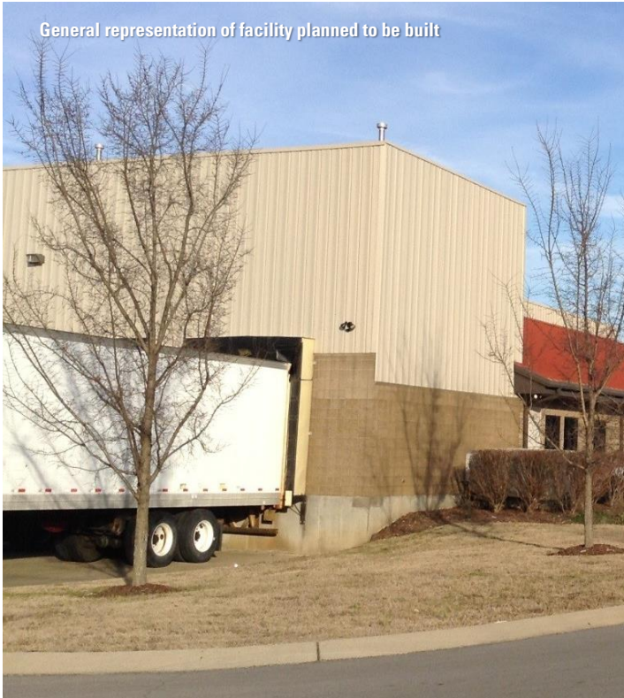
General representation of facility planned to be built

1541 Heil Quaker Blvd, La Vergne, TN 37086