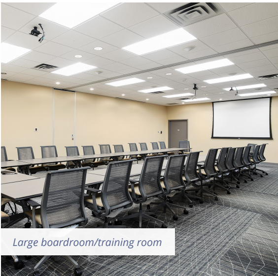
Large boardroom/training room