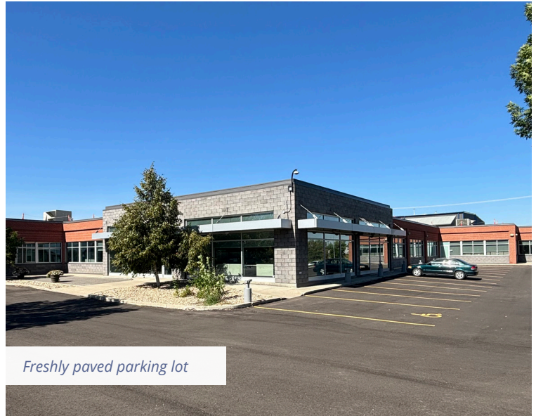
Freshly paved parking lot