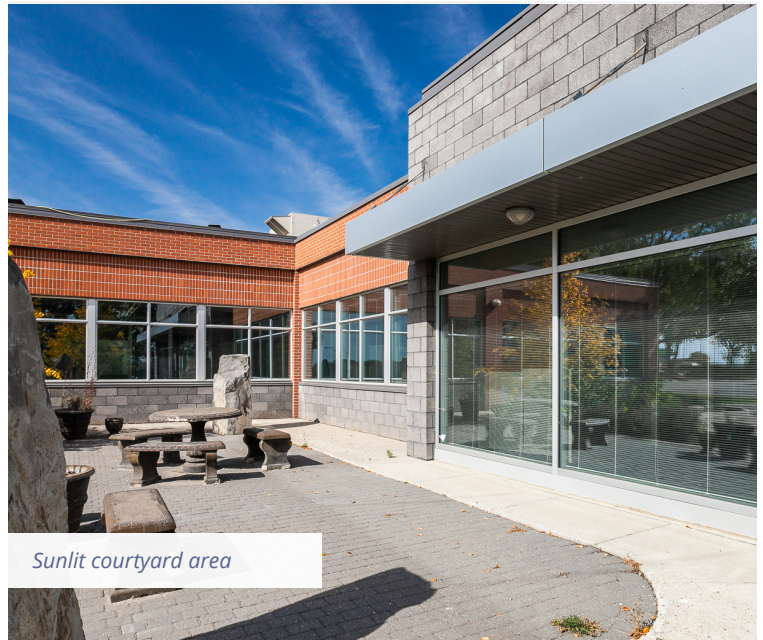
Sunlit courtyard area