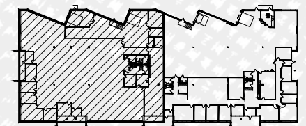
Key Plan - 1st Floor