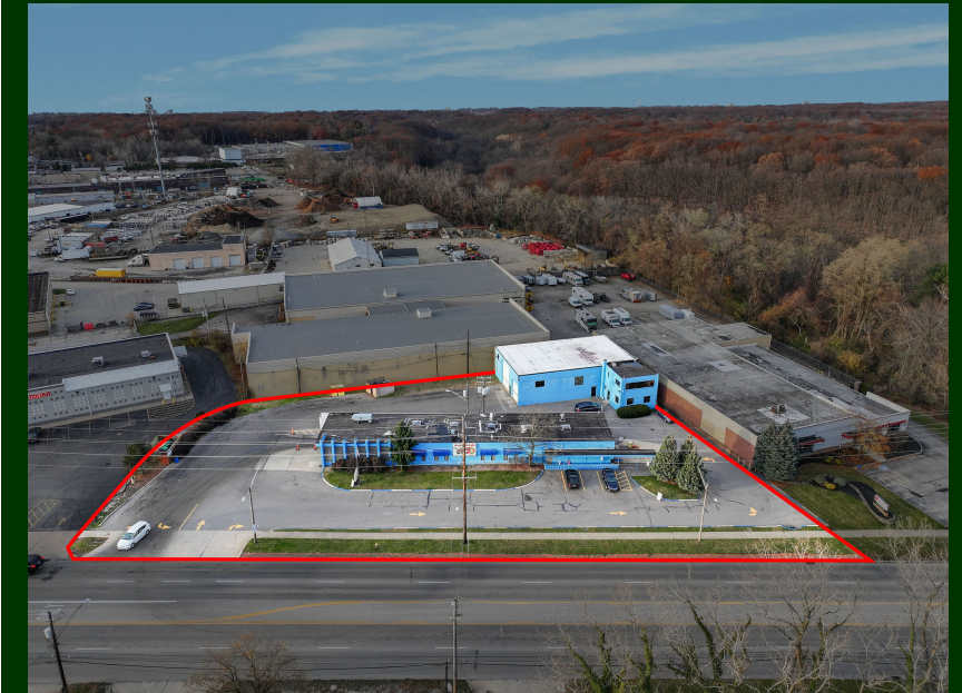
4325 & 4345 Monticello Blvd., South Euclid, OH 44121