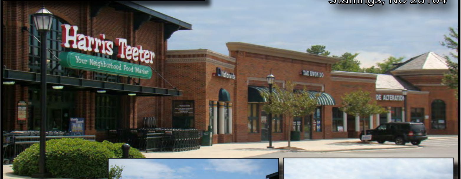
Stevens Mill Crossing Shopping Center