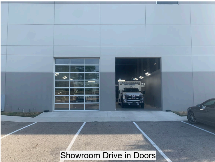
Showroom Drive in Doors