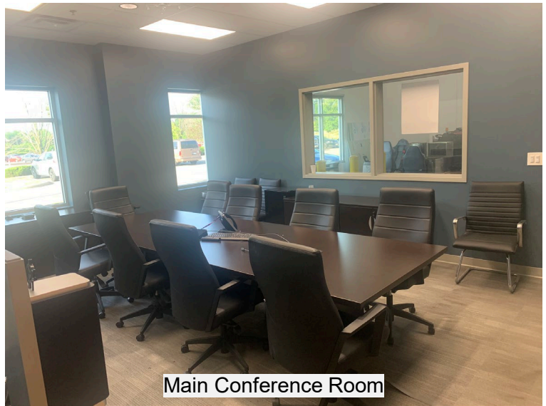
Main Conference Room