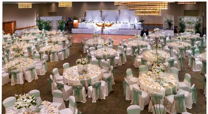
Top: lobby and escalator to 2nd floor. Center: left: cafe, right: pool deck. Lower: left: 2nd floor lobby, right: ballroom