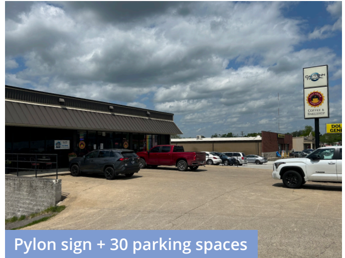
Pylon sign + 30 parking spaces