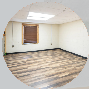
1,000 SF Office