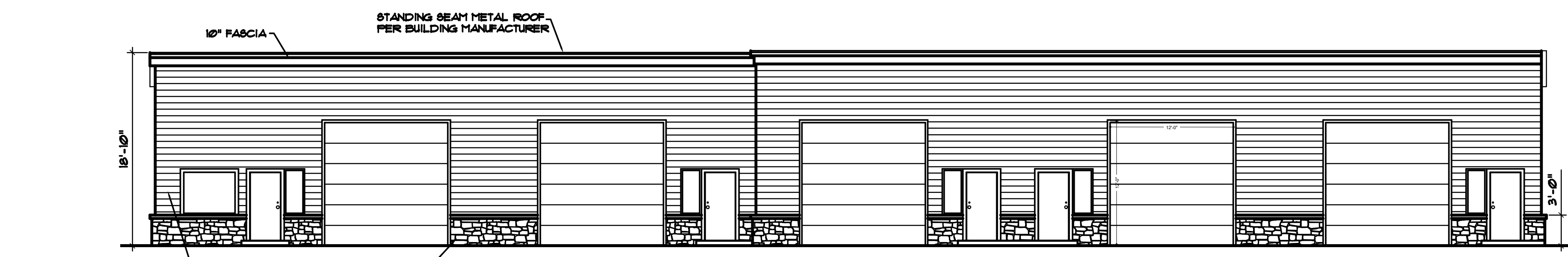
FRONT ELEVATION SCALE 1/4"=1'-0"