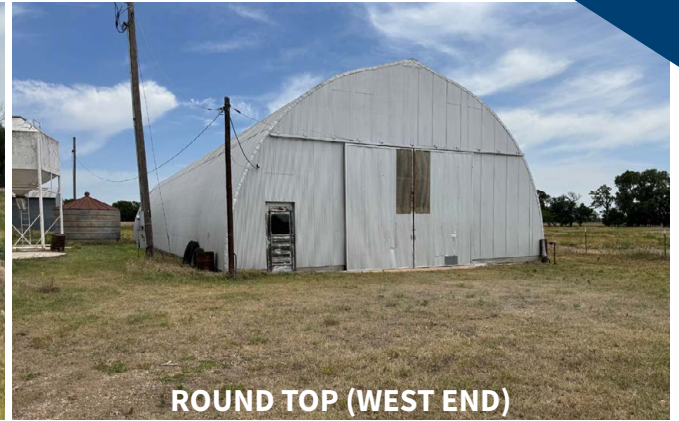
ROUND TOP (WEST END)