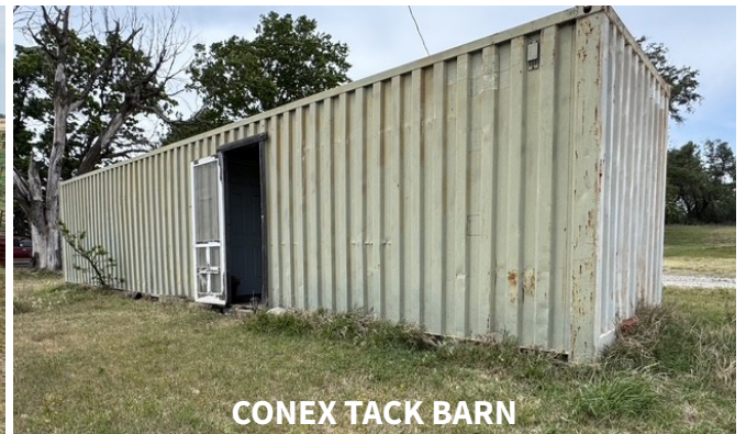
CONEX TACK BARN