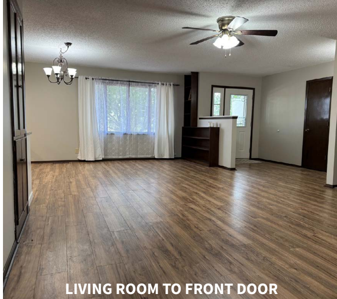
LIVING ROOM TO FRONT DOOR