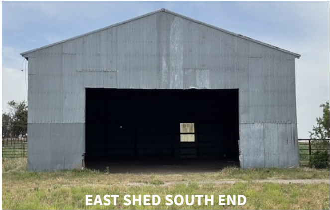
EAST SHED SOUTH END