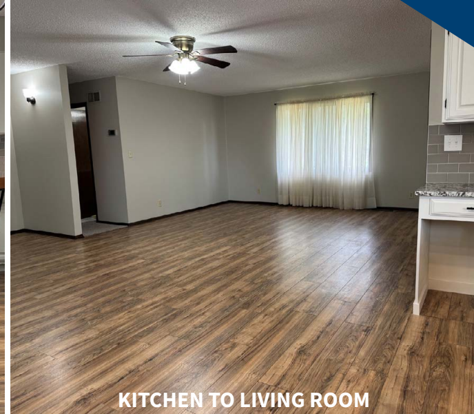
KITCHEN TO LIVING ROOM