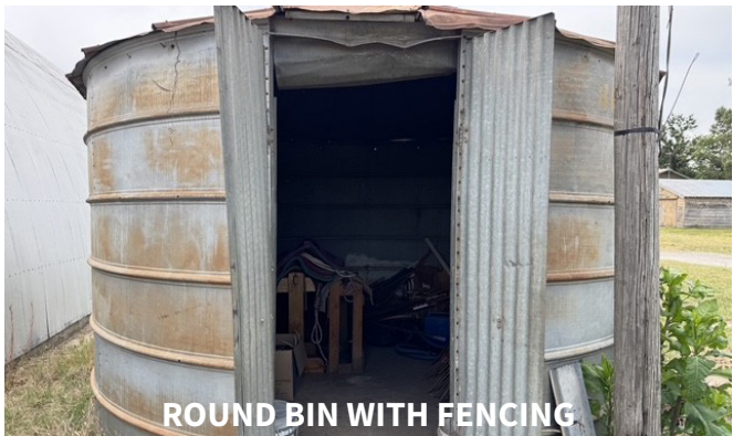
ROUND BIN WITH FENCING