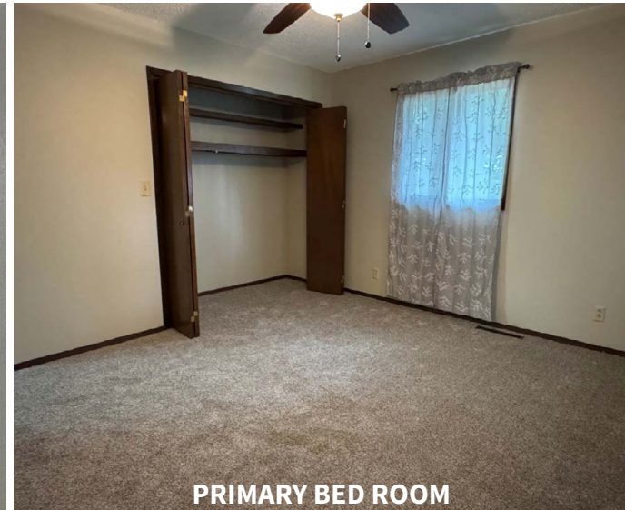
PRIMARY BED ROOM