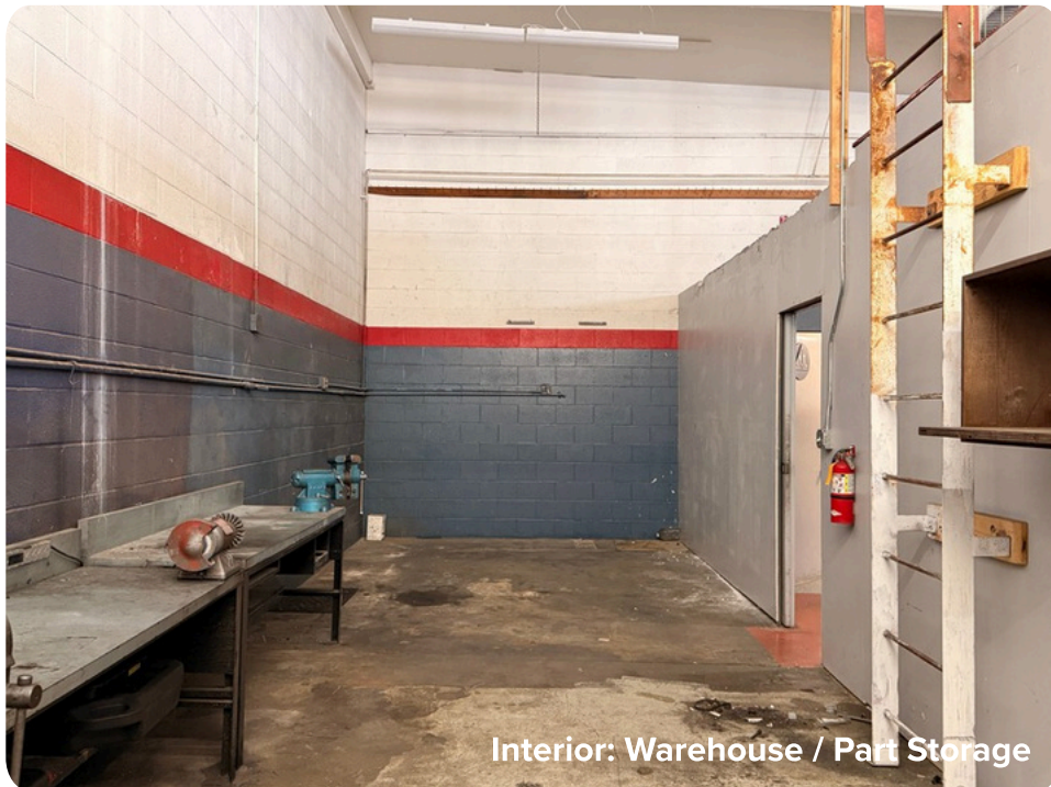
Interior: Warehouse / Part Storage