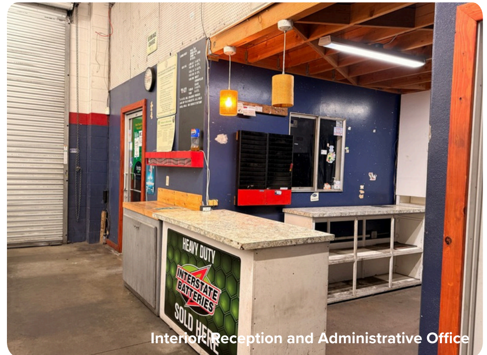
Interior: Reception and Administrative Office