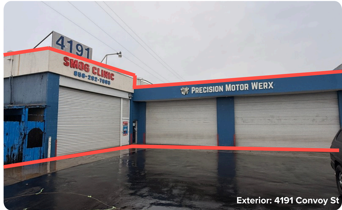
Exterior: 4191 Convoy St