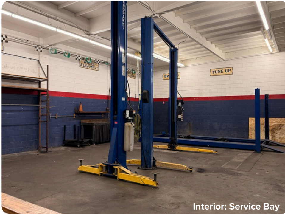
Interior: Service Bay