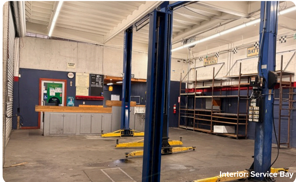
Interior: Service Bay