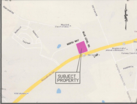
VICINITY MAP 1" = 1000'