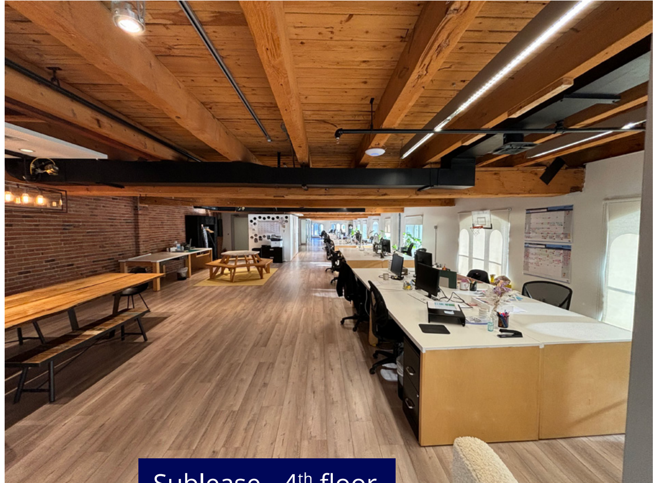
Sublease - 4th floor