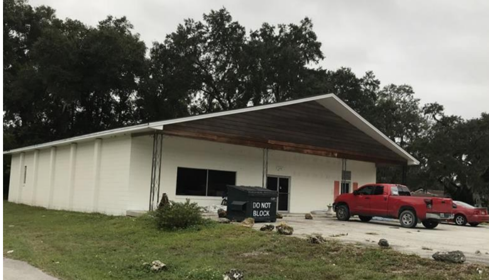
Concrete Block Building divided with separate entrances