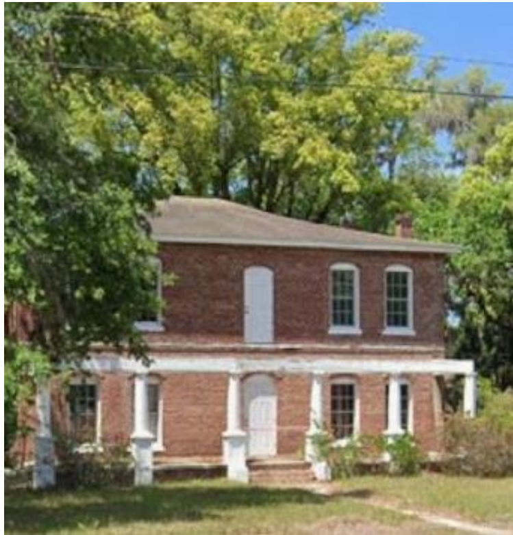
2 Story Brick Building