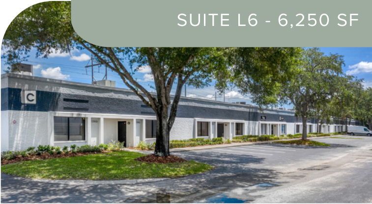
SUITE L6 - 6,250 SF

14160-14170 MCCORMICK DRIVE, SUITE L6 | TAMPA, FL 33626