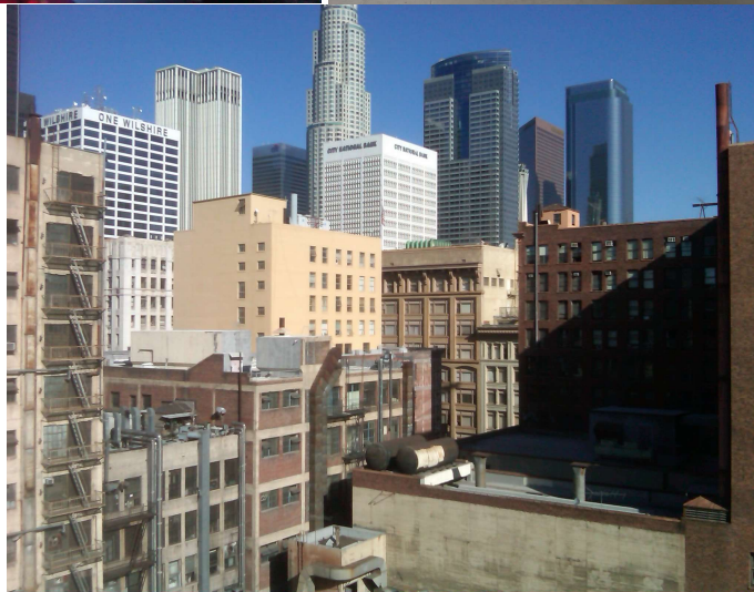
View from Rooftop