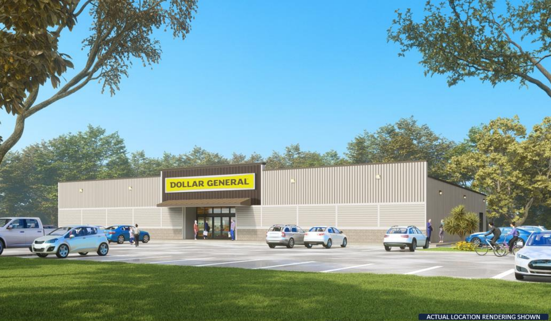
ACTUAL LOCATION RENDERING SHOWN