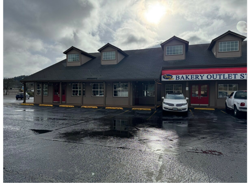
471 S A - Front View 1