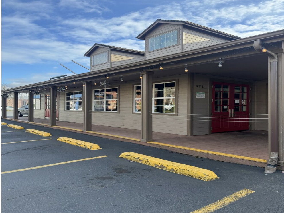
471 S A St - Front View 5