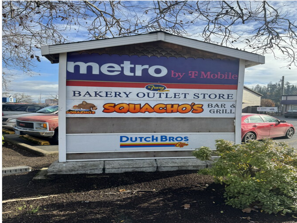
471 S A St - Sign