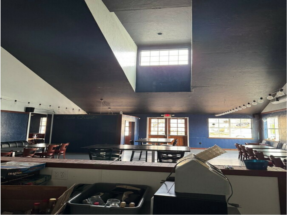
471 S A - Dining Hall 1