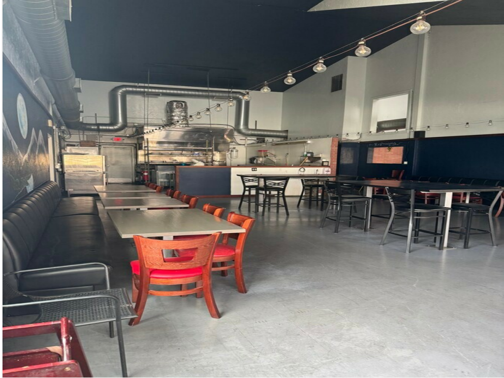
471 S A - Dining Hall