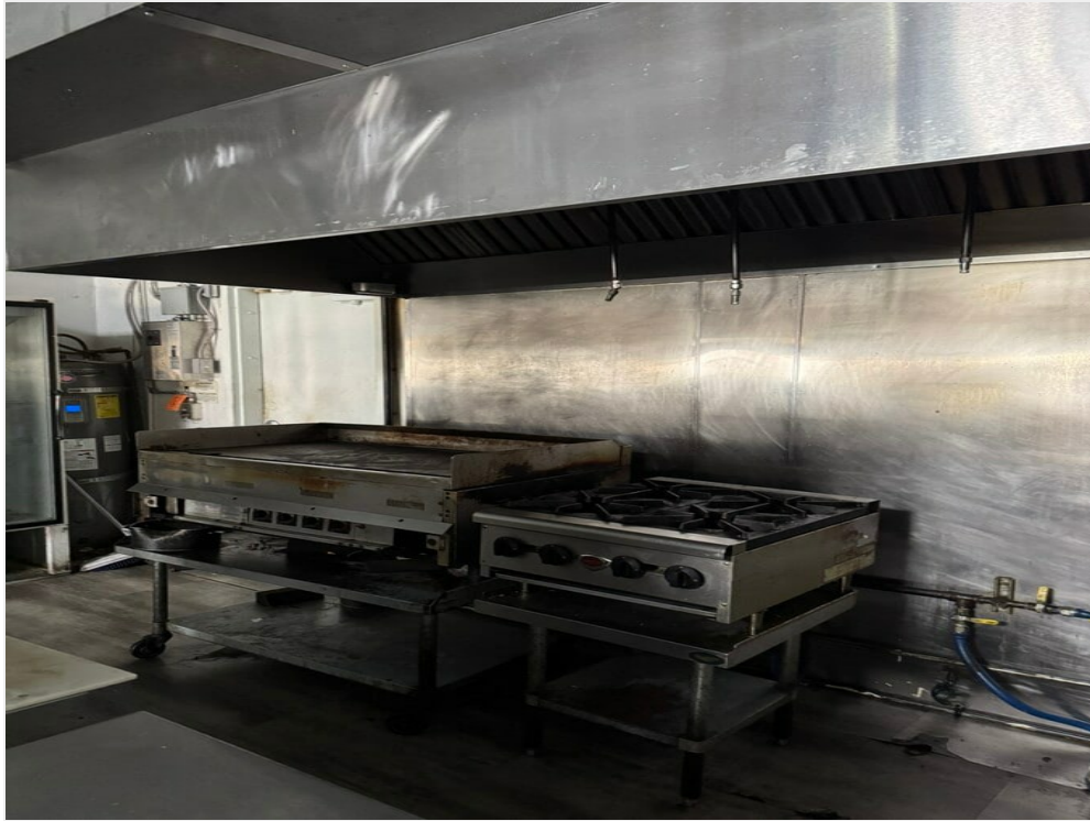
471 S A - Kitchen Hood & Grill