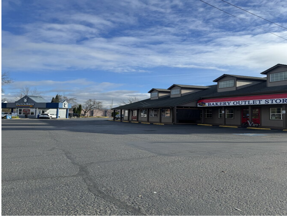
471 S A St - Front View 4