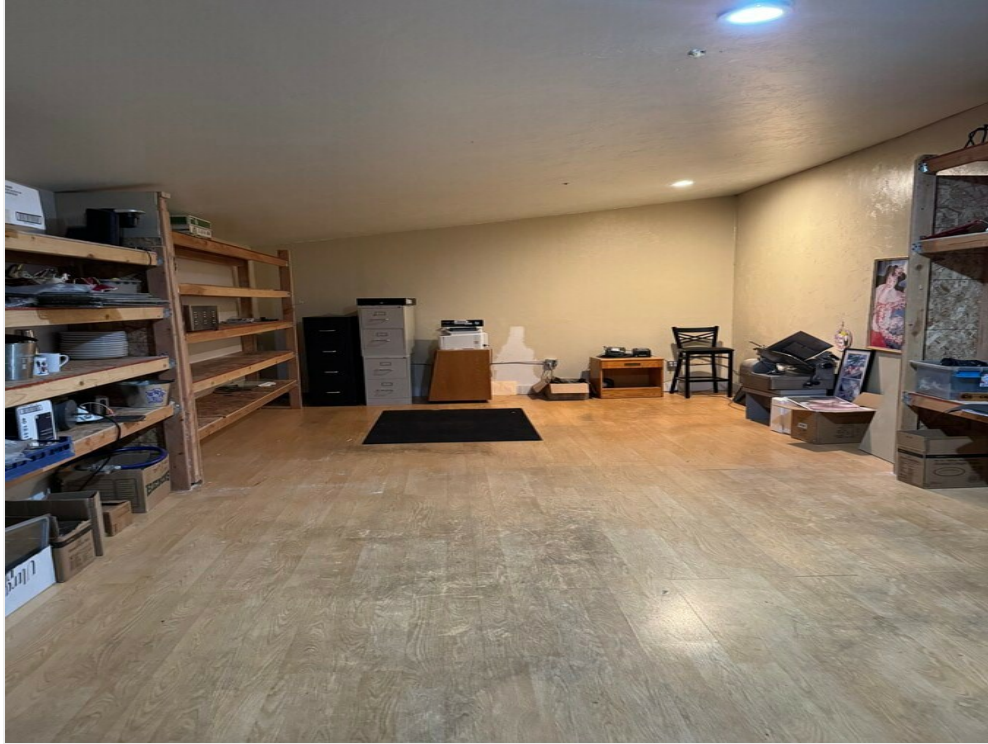
471 S A - Storage