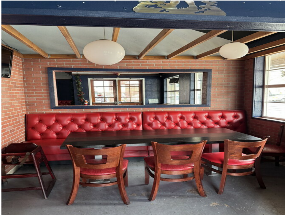
471 S A - Private Room