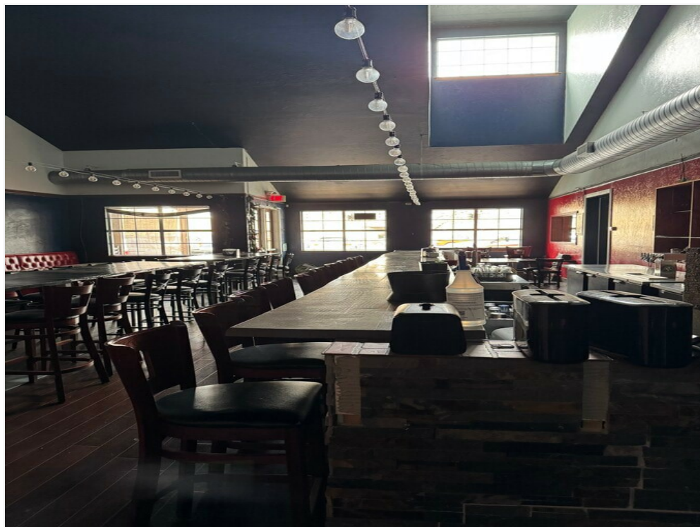
471 S A - Bar Area 1