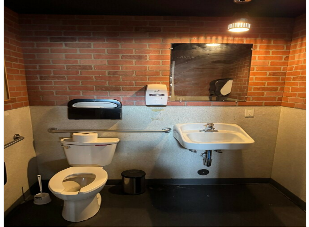
471 S A - Restroom