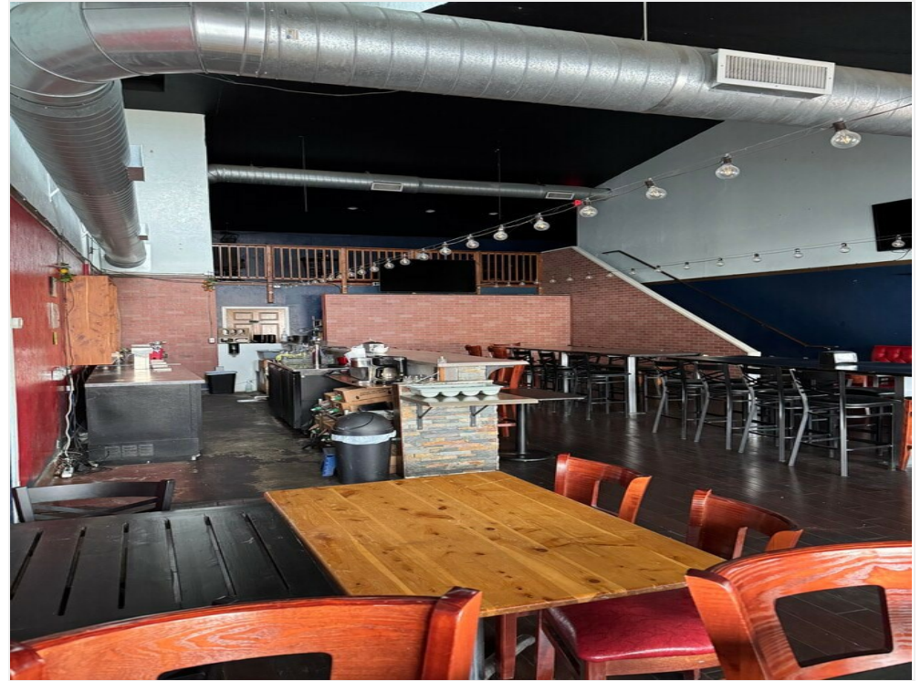
471 S A - Bar Area 2