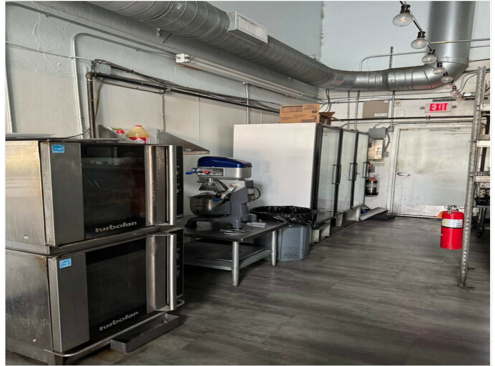
471 S A - Kitchen Appliance