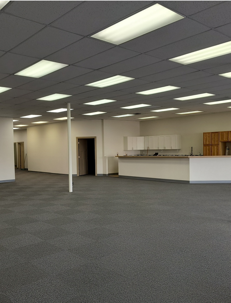
Showroom & Kitchen