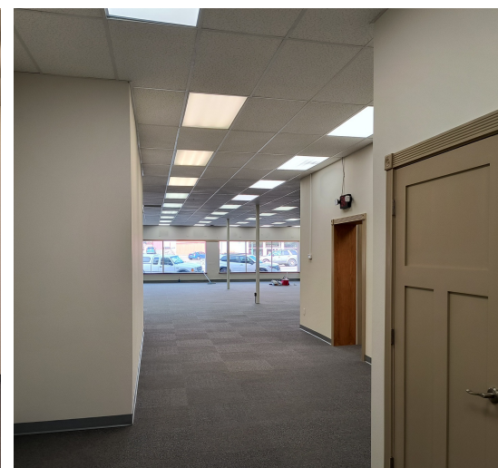
Hallway to Showroom