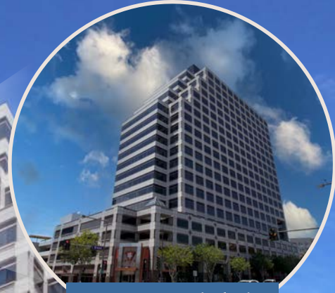
101 N. Brand Blvd. Office Building