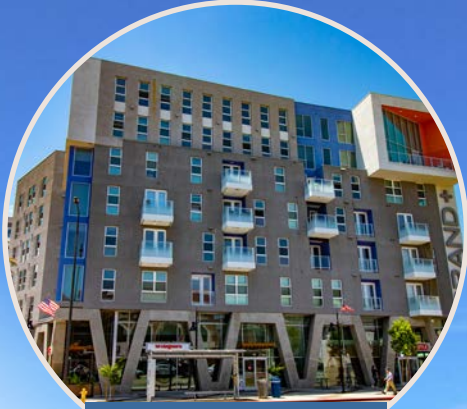
The Brand Luxury Apartments