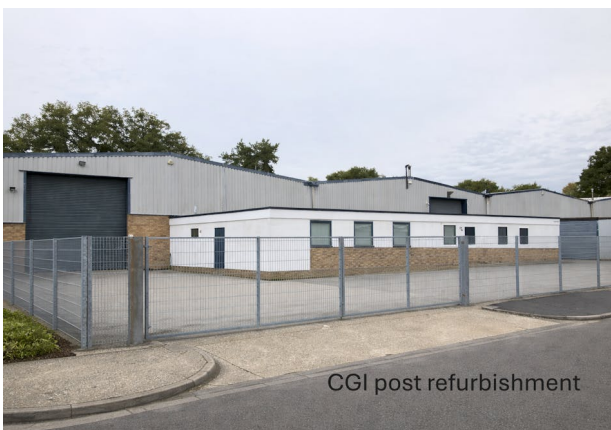
CGI post refurbishment