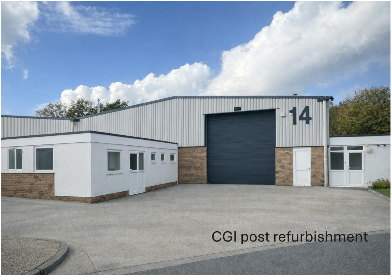
CGI post refurbishment