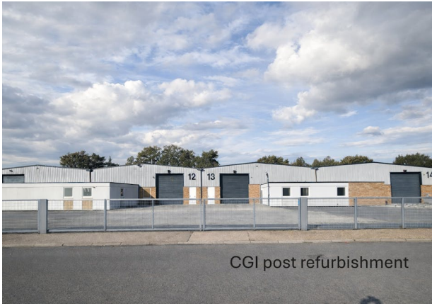
CGI post refurbishment