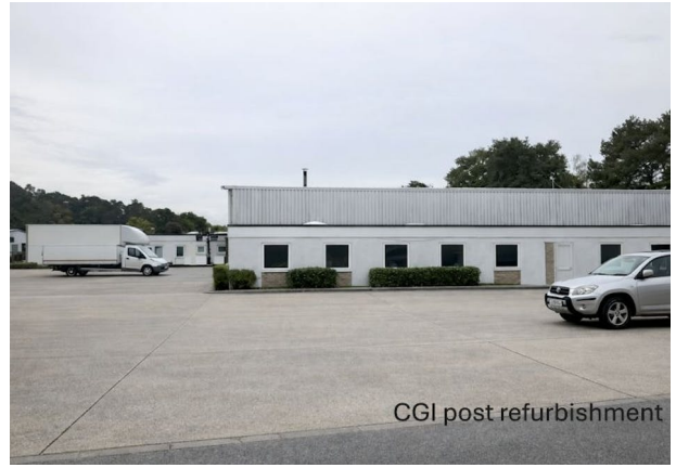
CGI post refurbishment