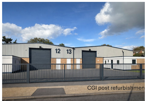
CGI post refurbishment