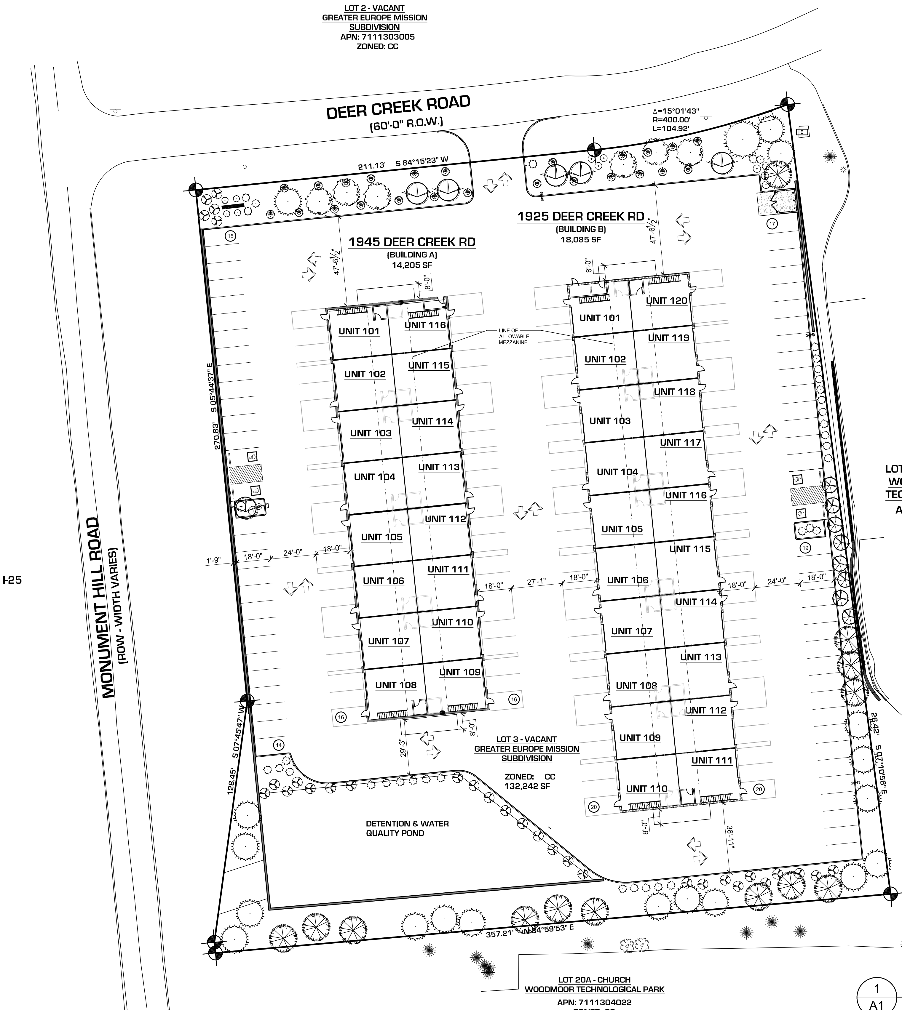
1945 Deer Creek Rd (BUILDING A)