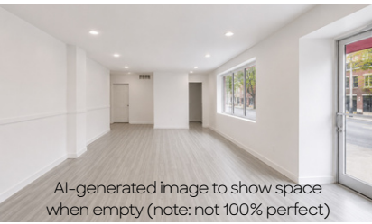
AI-generated image to show space when empty (note: not 100% perfect)