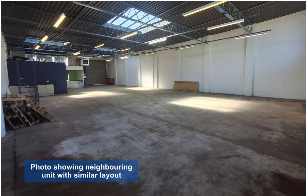
Photo showing neighbouring unit with similar layout

Each party will be responsible for their own legal costs incurred in this transaction. In the normal manner, the ingoing tenant will be liable for any LBTT, registration dues and VAT thereon. All prices quoted are exclusive of VAT.