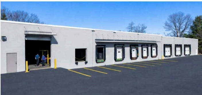
*Image is a building rendering