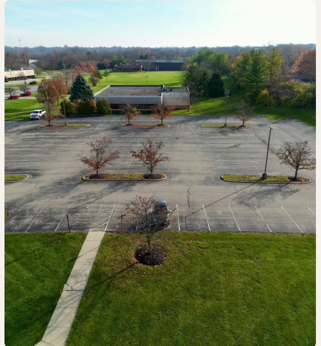
1445 KEMPER MEADOW DRIVE · FOREST PARK, OHIO 45240