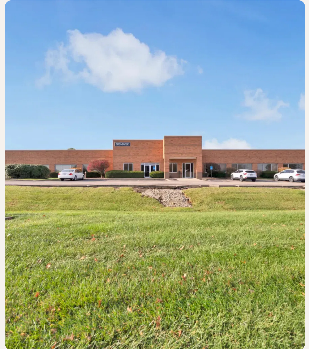
1445 KEMPER MEADOW DRIVE · FOREST PARK, OHIO