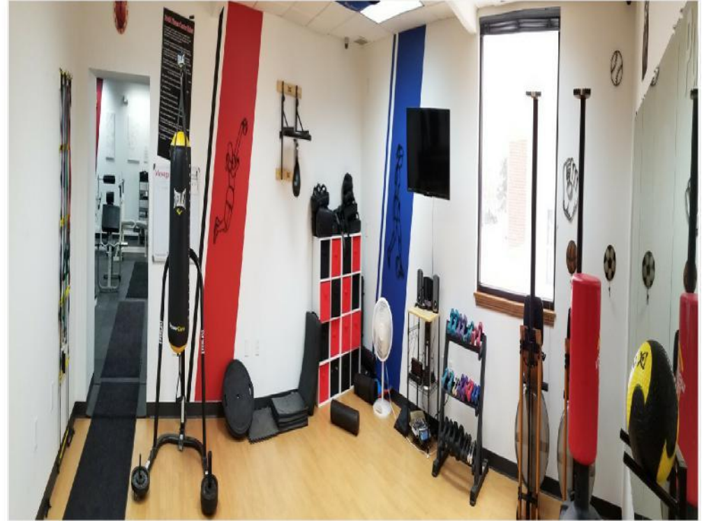
Mudd Campus Fitness Center