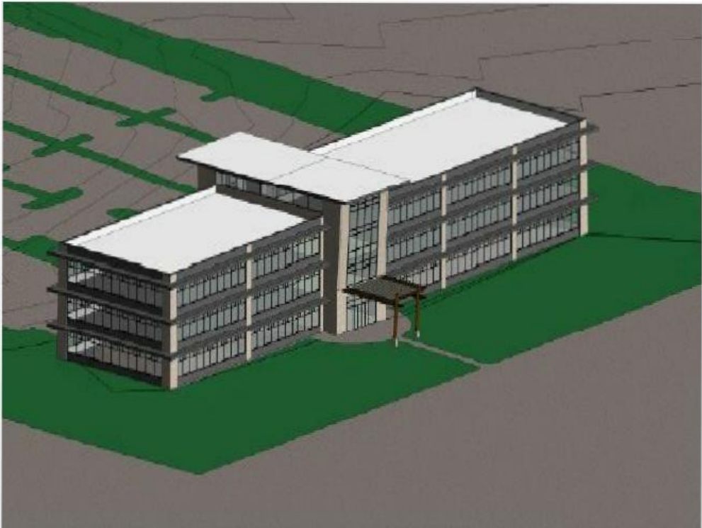
Mudd Campus N. Lot Concept 1B