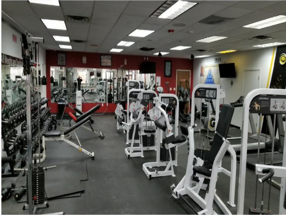
Mudd Campus Fitness Center