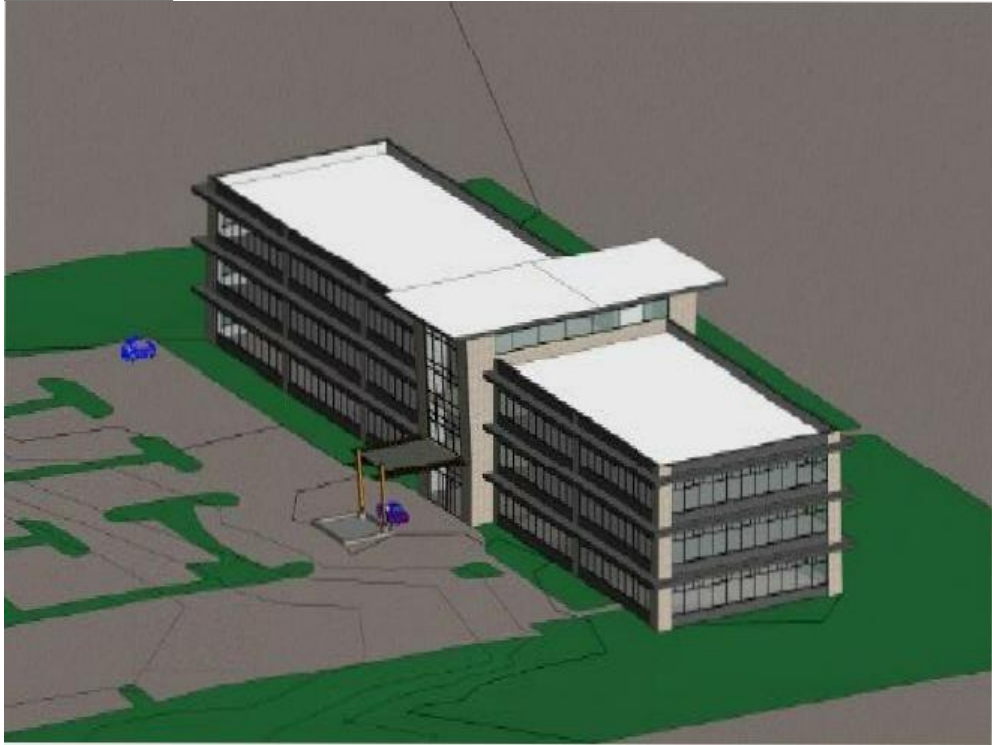
Mudd Campus N. Lot Concept 1A