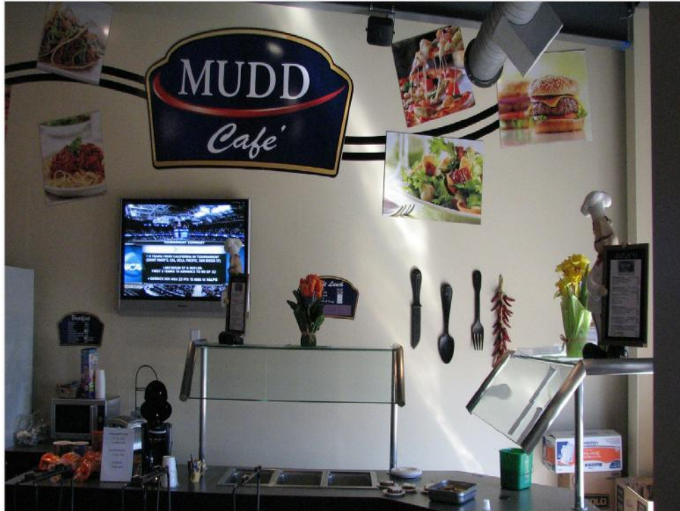
Mudd Campus Cafe