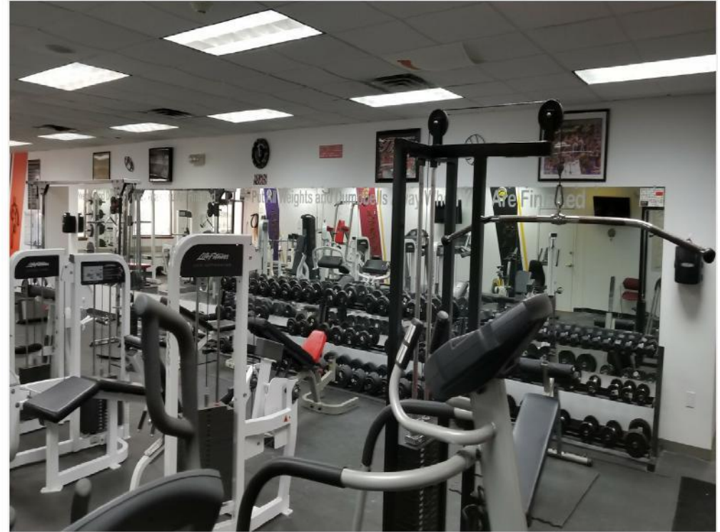
Mudd Campus Fitness Center