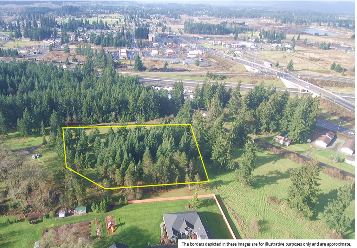
The borders depicted in these images are for illustrative purposes only and are approximate.