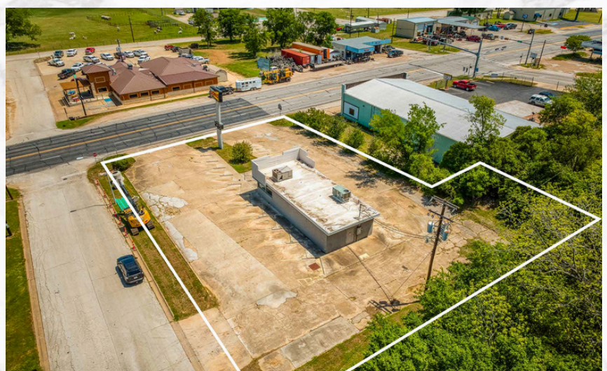
DIRECT HIGHWAY FRONTAGE