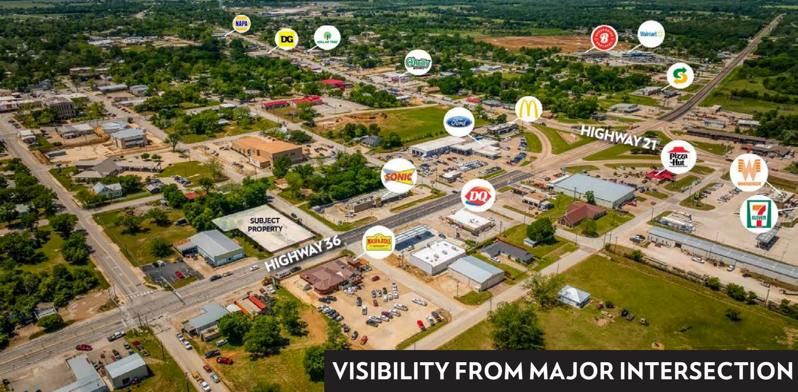
VISIBILITY FROM MAJOR INTERSECTION