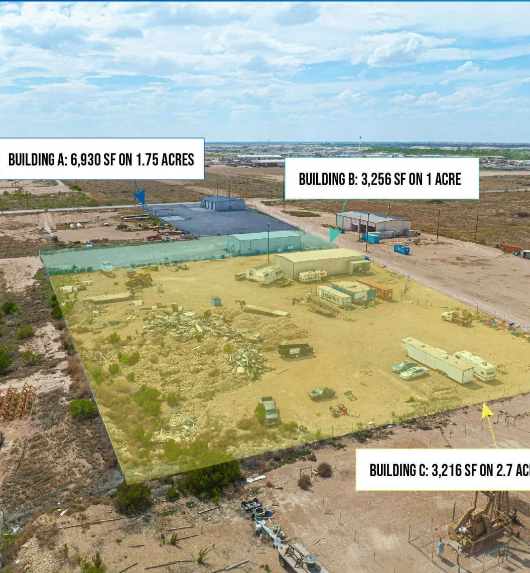
BUILDING A: 6,930 SF ON 1.75 ACRES