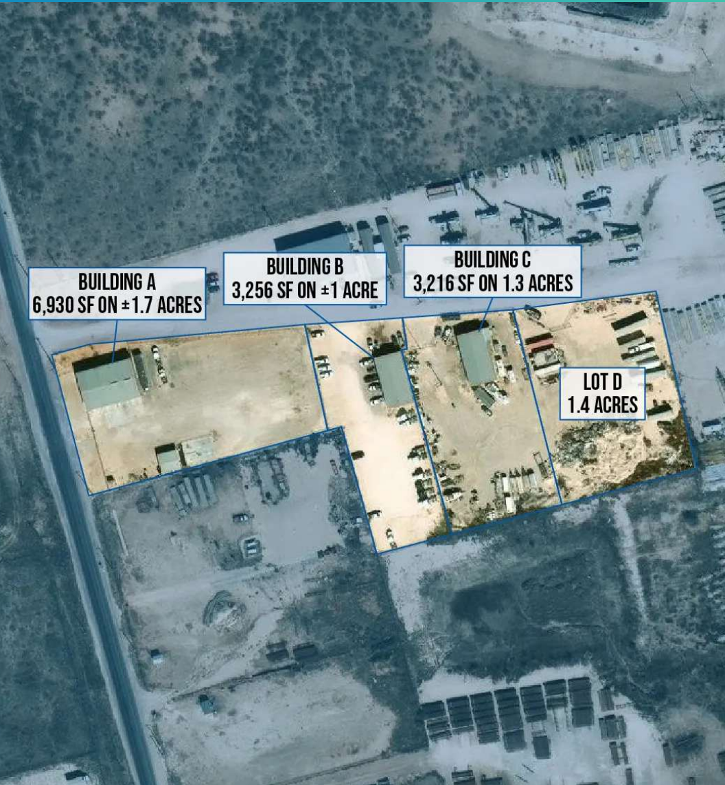
BUILDING A 6,930 SF ON ±1.7 ACRES