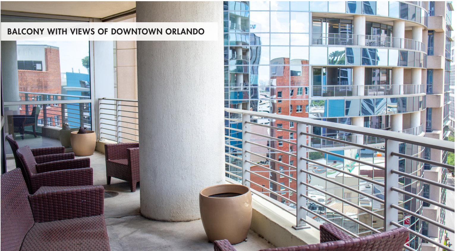
BALCONY WITH VIEWS OF DOWNTOWN ORLANDO