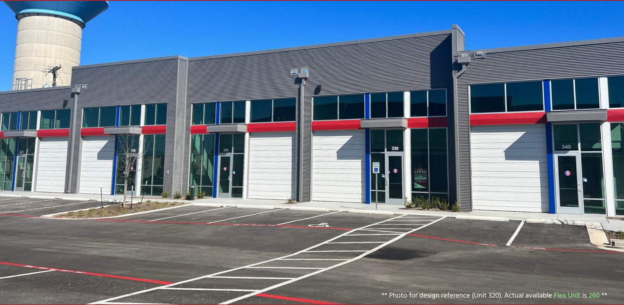
** Photo for design reference (Unit 320). Actual available Flex Unit is 260 **