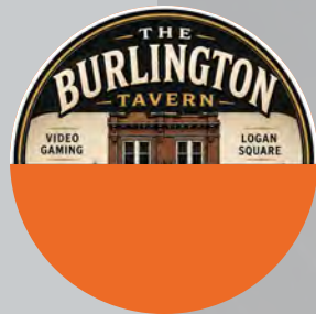
Potential To Add Video Gaming