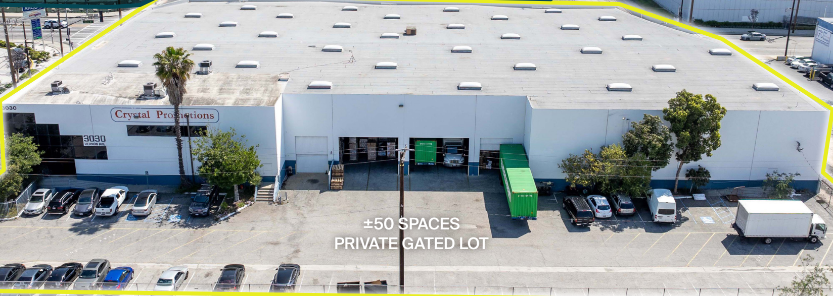
±50 SPACES PRIVATE GATED LOT