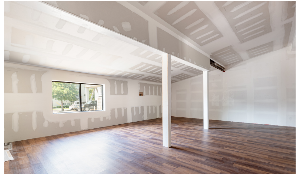
Existing condition: space will be fully built out per attached plan.