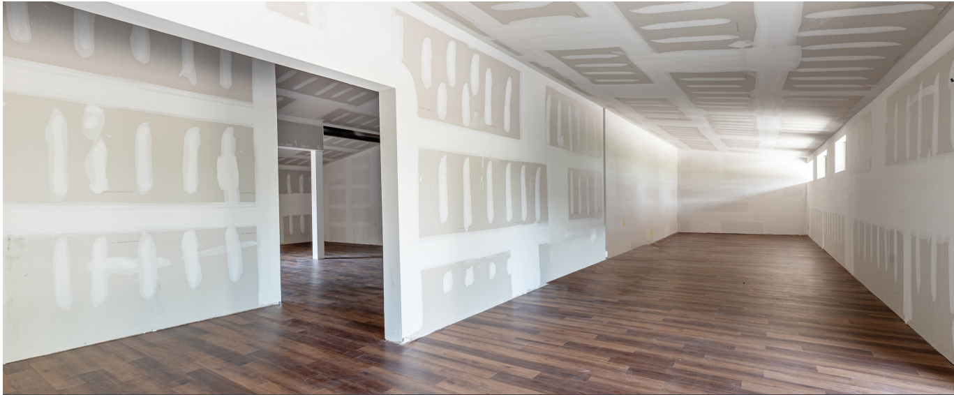
Existing condition: space will be fully built out per attached plan.