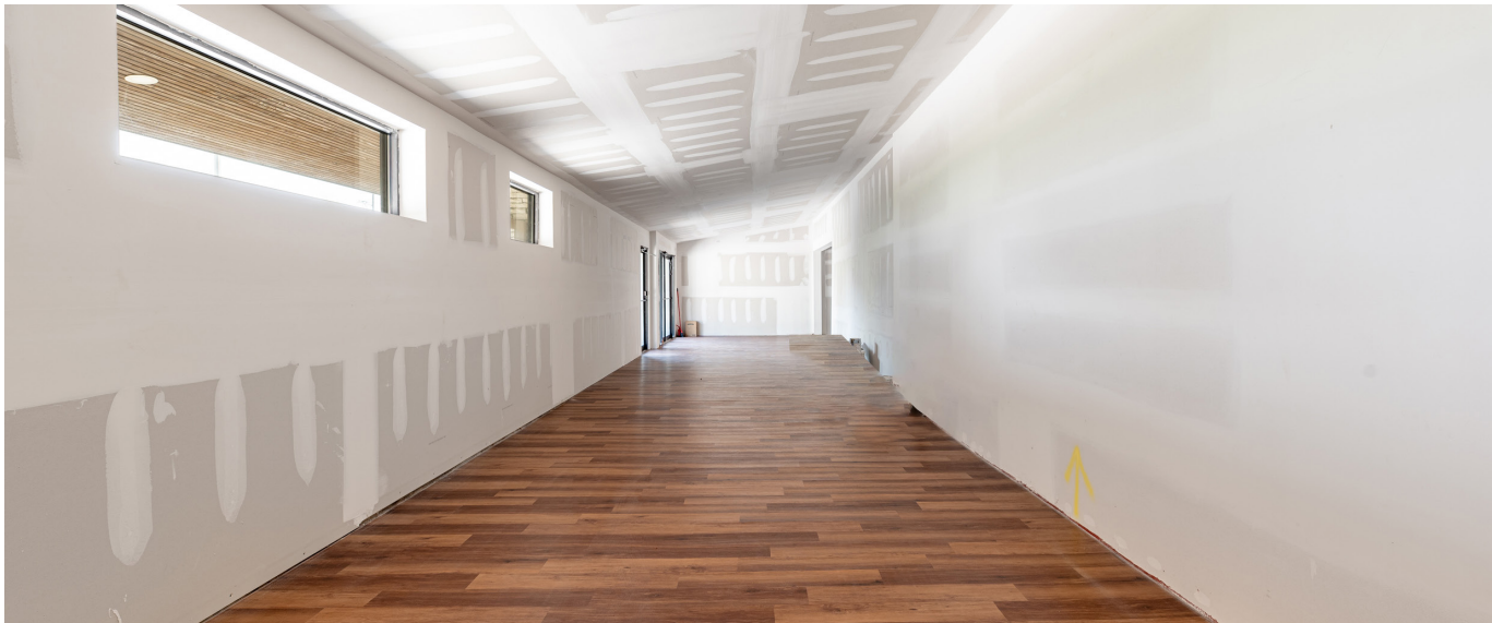
Existing condition: space will be fully built out per attached plan.