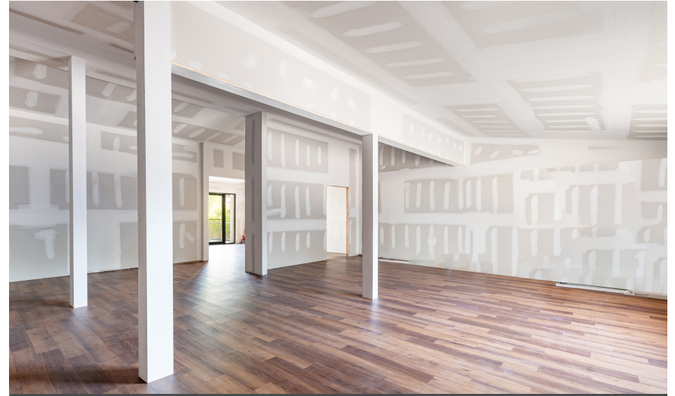
Existing condition: space will be fully built out per attached plan.