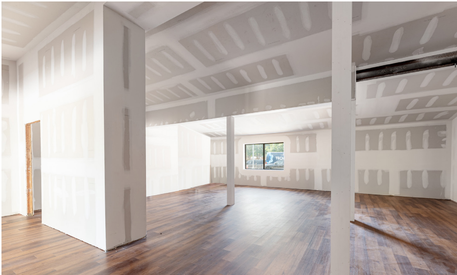
Existing condition: space will be fully built out per attached plan.