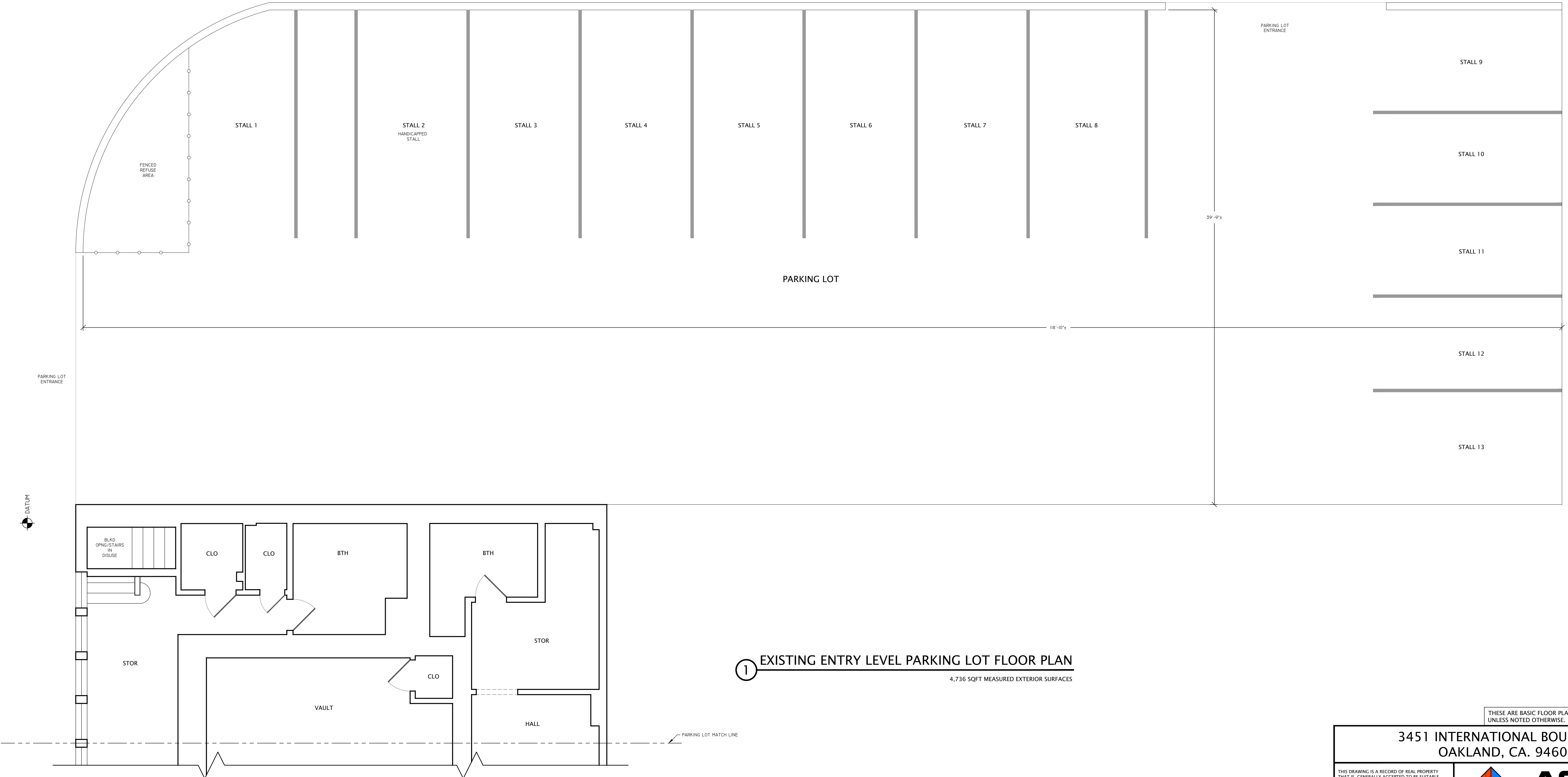
1 EXISTING ENTRY LEVEL PARKING LOT FLOOR PLAN 4,736 SQFT MEASURED EXTERIOR SURFACES

THESE ARE BASIC FLOOR PLANS. NO INTERIOR ELEMENTS SHOWN, UNLESS NOTED OTHERWISE.