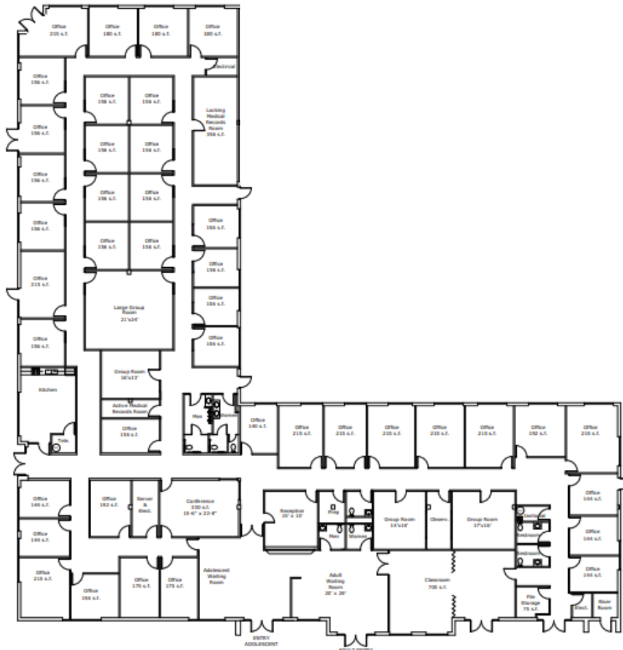
1 FLOOR PLAN SCALE: 1/32" = 1'-0"