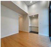
Typical Open-Plan Office