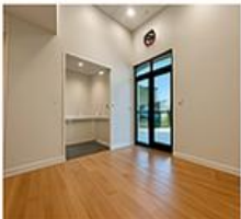
Modern Reception Area