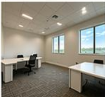
Typical Open-Plan Office