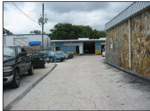
Rear Bldg – 2,400 sf – rented till 2010 Plenty of side and rear parking!!