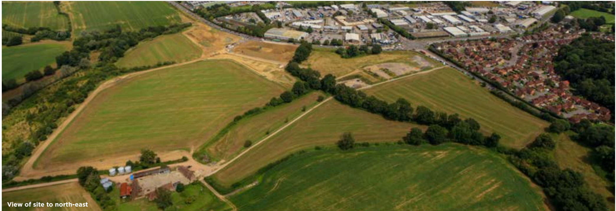
View of site to north-east