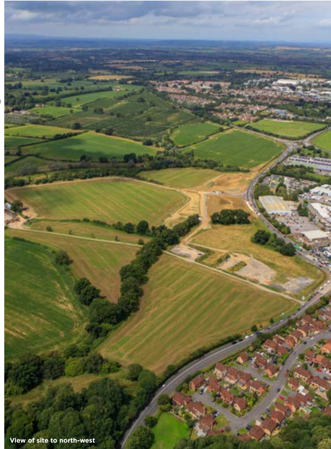
View of site to north-west