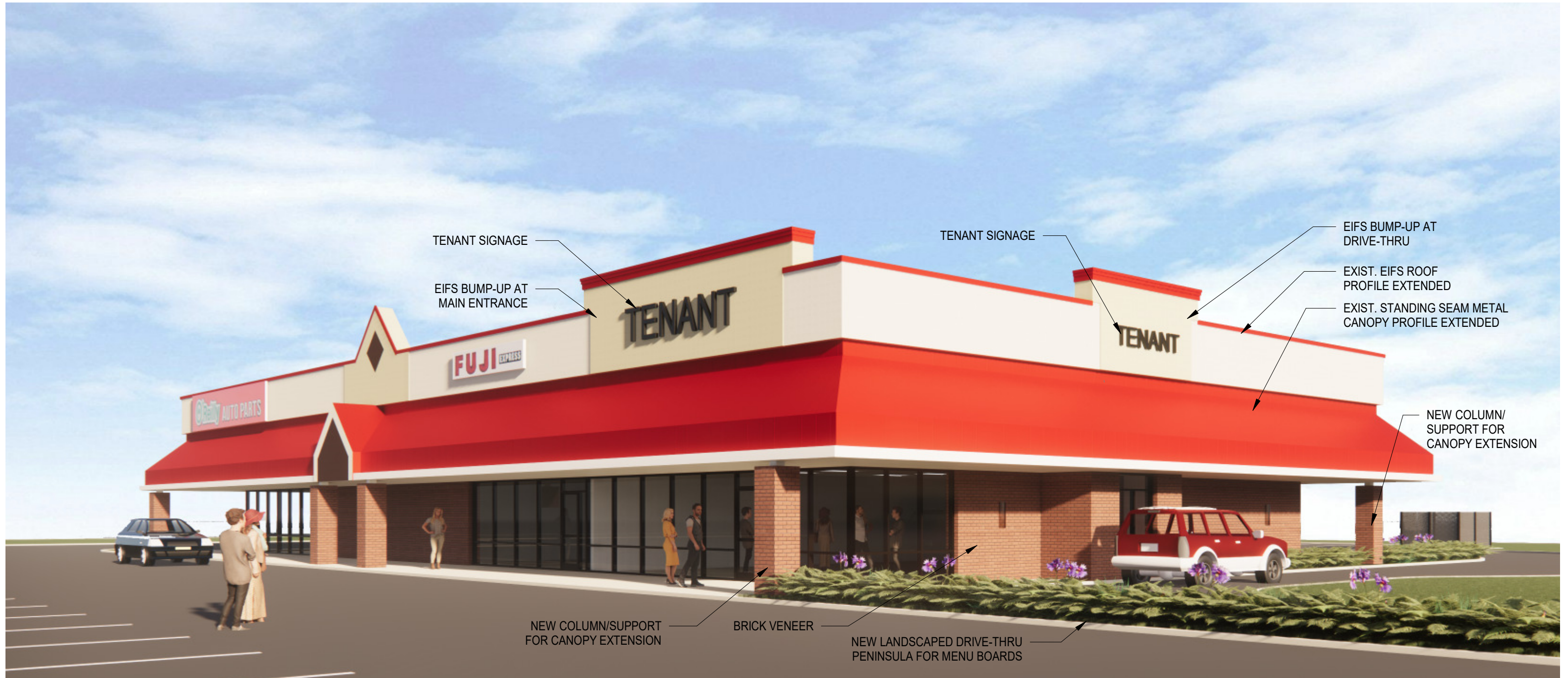
1 DRIVE-THRU VIEW PERSPECTIVE - OPTION 1 NTS